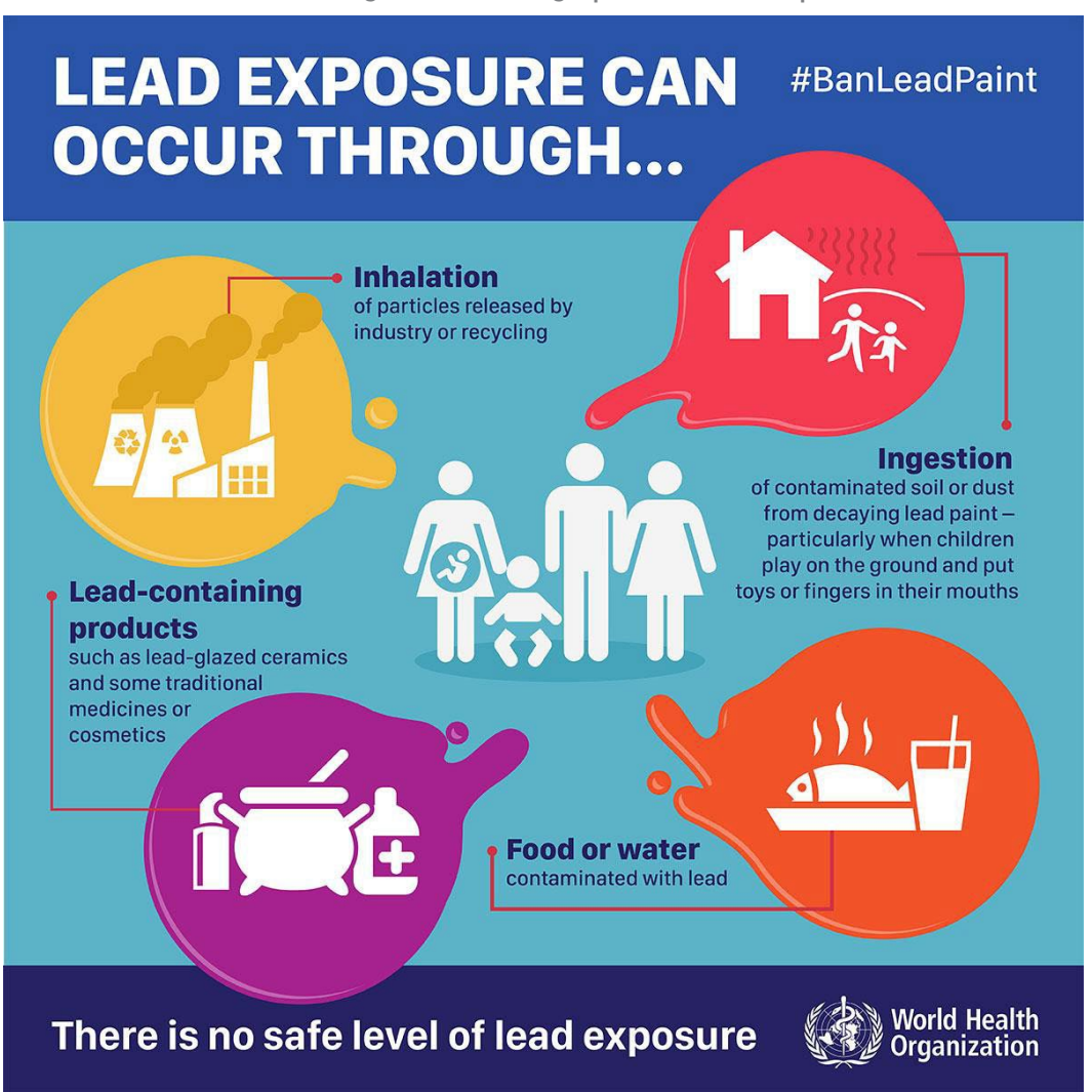
SOURCE: "Chapter 2. Routes of Lead Exposure, Toxicology, and Societal Costs of Lead Exposure," in Wisconsin Childhood Lead Poisoning Prevention and Control Handbook for Local Public Health Departments (Wisconsin Department of Health Services, September 2024), <a href="https://www.dhs.wisconsin.gov/publications/p00660-2.pdf">https://www.dhs.wisconsin.gov/publications/p00660-2.pdf</a>.