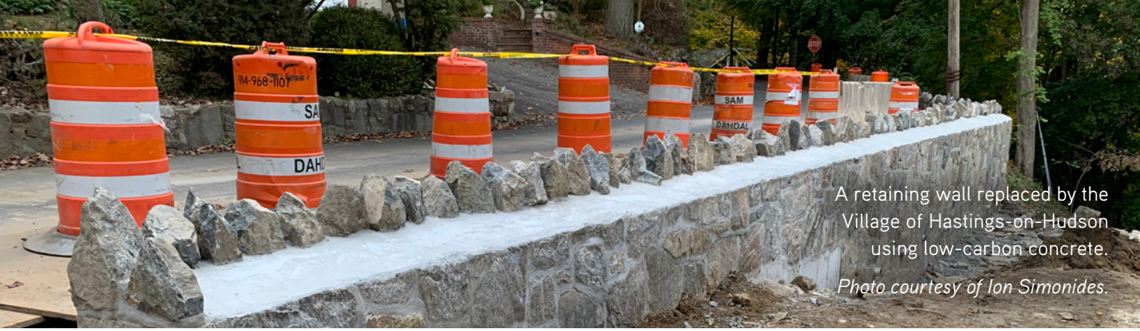
A retaining wall replaced by the Village of Hastings-on-Hudson using low-carbon concrete.